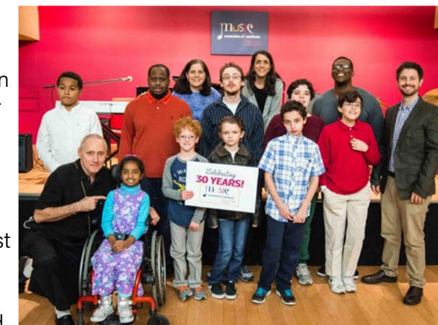
MTI celebrates 7th Annual Spring Music Sharing

MTI will receive the "Power of Healing" Award, in celebration of its 30th anniversary. Established in 1986, MTI today is the largest provider of community-based music therapy and adapted instruction in the greater Westchester region, serving 2,000 individuals with special needs each year. In 2013, MTI expanded to serve military veterans through the "Healing Our Heroes" program.